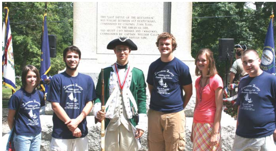
C.A.R. members at Blue Licks