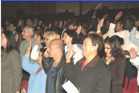
Taking the Naturalization oath