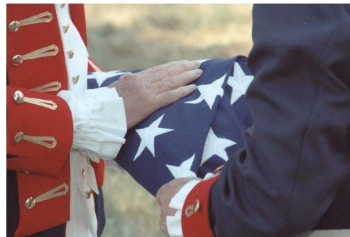
Flag Folding Ceremony at Patriot Grave Marking

Participate in the registration and marking of the graves of our Revolutionary War Ancestors.