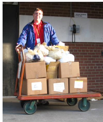
Recent donation to Veterans Hospital in Murfreesboro, TN . This hospital is one of several V.A. hospitals that receive donations from the Gov. Isaac Shelby chapter.