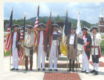
Gov. Isaac Shelby Color Guard

Some of us have done this by being involved with our chapter's color guards. We have traveled to many of the Revolutionary War battle sites where we carry our flags and march with units from several states. We also present wreaths from our chapters and the state. Locally, you can be involved with Patriot grave markings, youth activities, and other events. If you have any kind of uniform; if you can shoot a black-powder gun; if you can play the drum or fife; or, if you just want to have fun, consider being part of the KYSSAR color guard. If you are interested, send e-mail to: cscott@insightbb.com