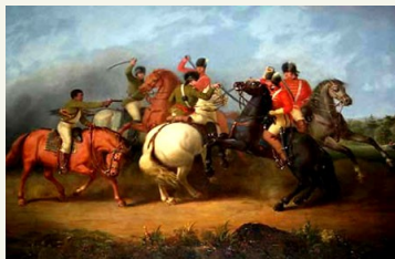
Painting of the Battle of Cowpens