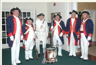
Louisville Thruston Color Guard