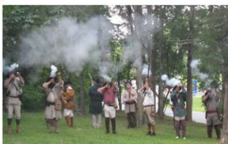
Gun Salute at Memorial Service