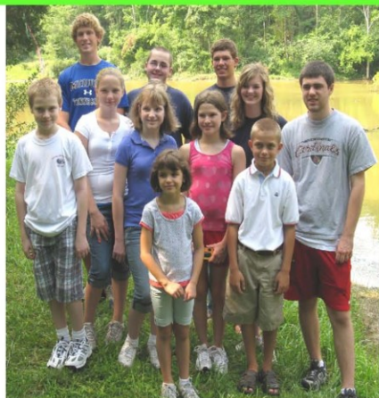
C.A.R. members at Yew Dell Gardens.