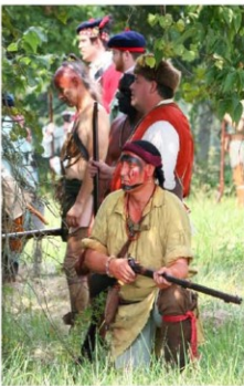
Picture from Blue Licks Battle reenactment.