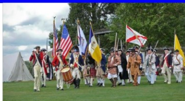
Color Guard at Point Pleasant, WV