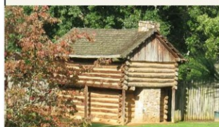
Watauga Settlement at Sycamore Shoals