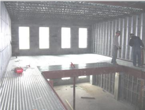
Mezzanine ready for concrete.