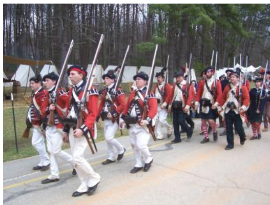
Redcoats, at least those who were not killed or wounded, march from the battlefield.