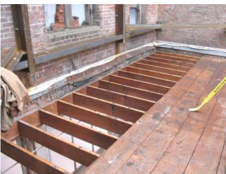
Old roof being removed