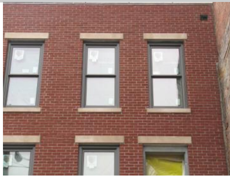
Back of library