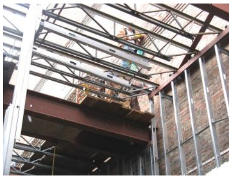
Framework for new roof