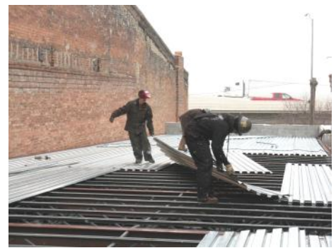
Metal sheets placed on roof

Check out the construction video's at www.sar.org