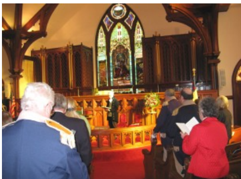
Colonial church service at Washington, GA.