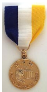
Martha Washington Medal