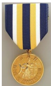
SAR medal of Appreciation