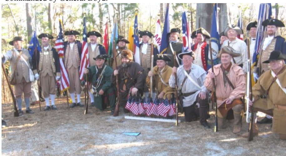
Group picture at the Battle of Kettle Creek ceremony. Plan to attend next year!