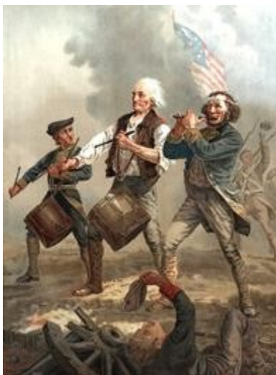
“Spirit of 76”

Could you have given a better answer? If not, you are not smarter than a second grader in Patriotism!