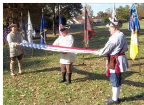
Flag-Folding ceremony by SAR members