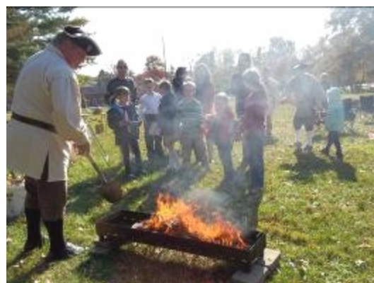
Old flags, that were tattered and torn, were brought to the fire master by troop members.