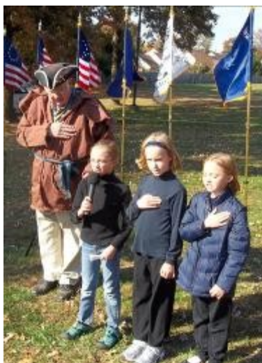
American Heritage Girls lead the Pledge to the Flag.