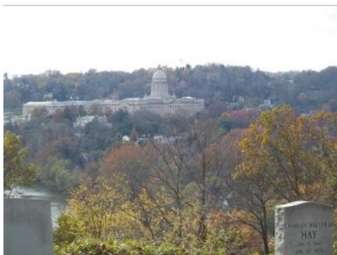
What a nice setting for a cemetery.

Thanks to those who have been taking part in Kentucky Color Guard activities.