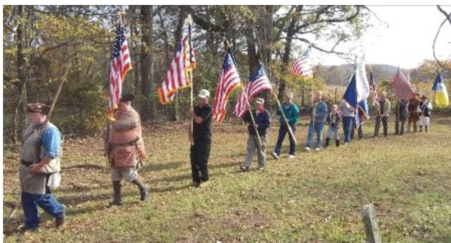
Colors and Standards carried in to open the ceremony