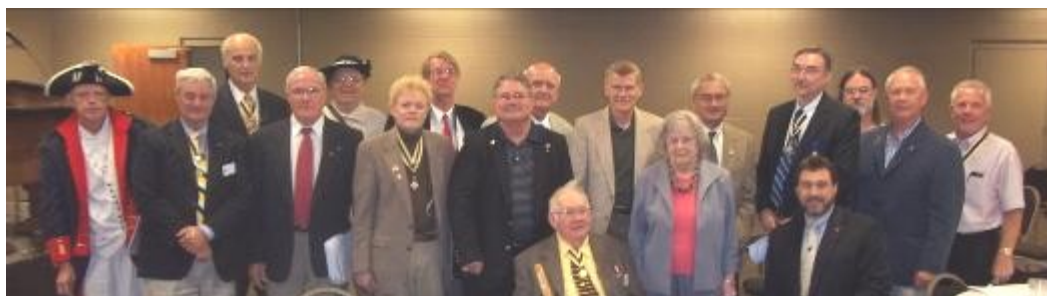
Group shot of some of the Kentucky members at the state meeting.