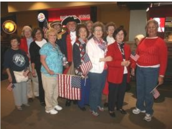
DAR members (plus one) waiting for the Honor Flight to arrive at the airport.