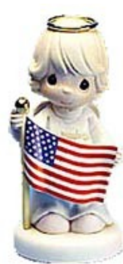
“We are free!”