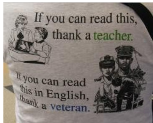
Lettering on tee-shirts worn by the World War II Veterans and Guardians.