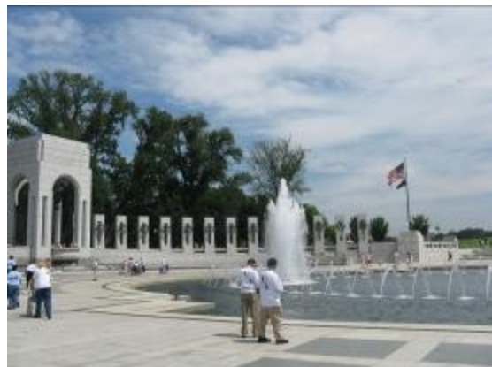
World War II Memorial