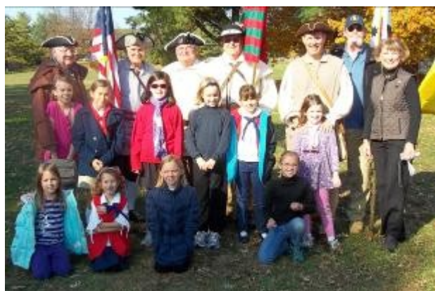
Group picture: SAR, DAR, C.A.R. and American Heritage Girls.