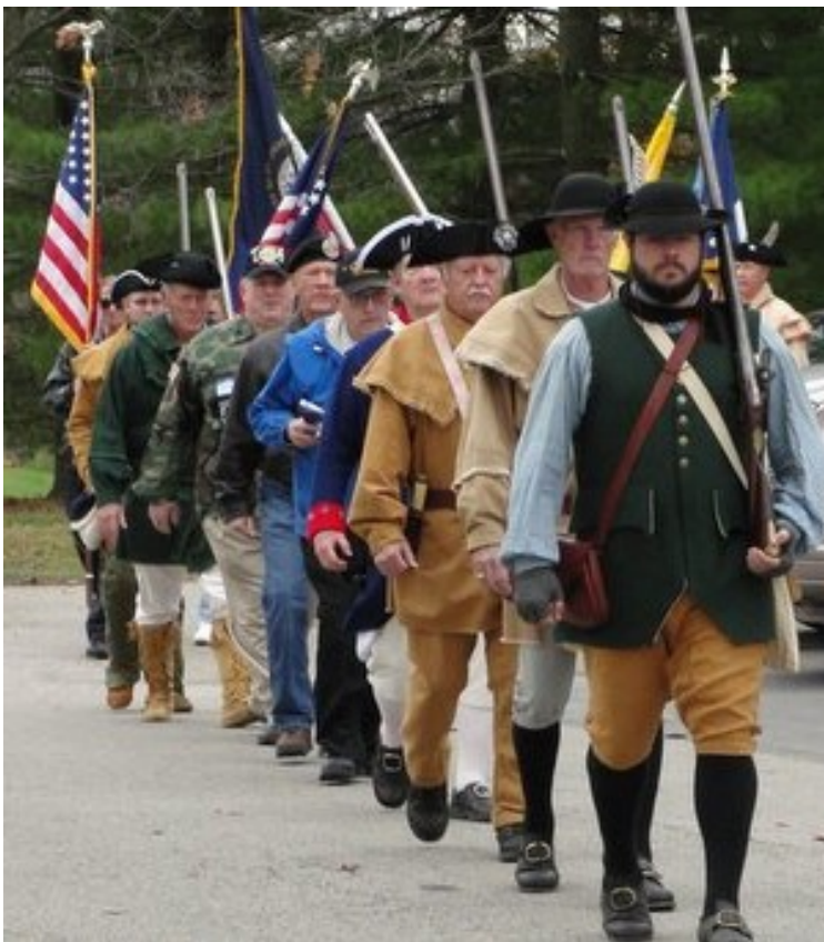
Simon Kenton Chapter Color Guard At Highland Cemetery on Veterans Day