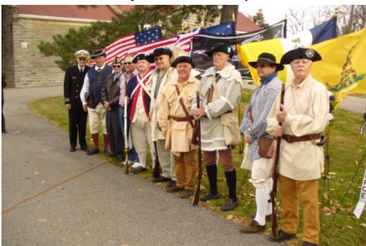
Simon Kenton Chapter Color Guard At Highland Cemetery on Veterans Day