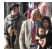
Different people but same type of picture.