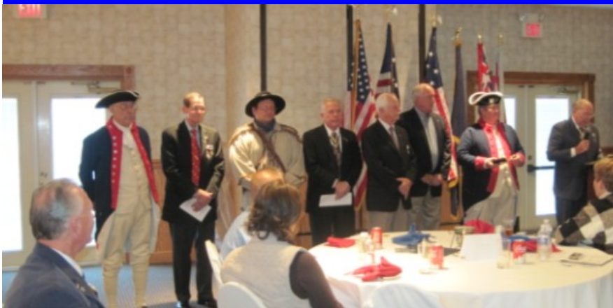
Simon Kenton Chapter Officers for the year 2013 take oath of office.