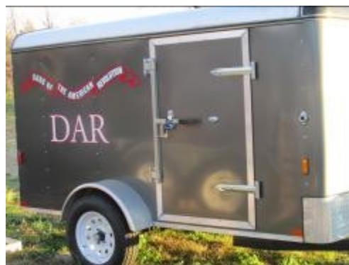
Trailer used to deliver items to several V.A. hospitals.