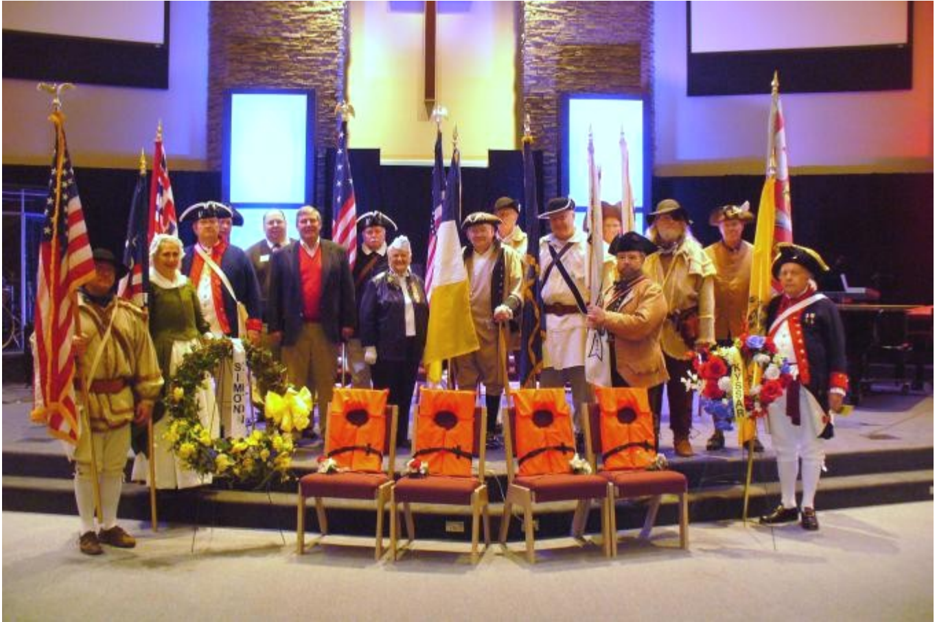
Members from the Simon Kenton Chapter, William Arnold Chapter and the Gov. Isaac Shelby Chapter work together at the Four Chaplains event in Northern Kentucky.