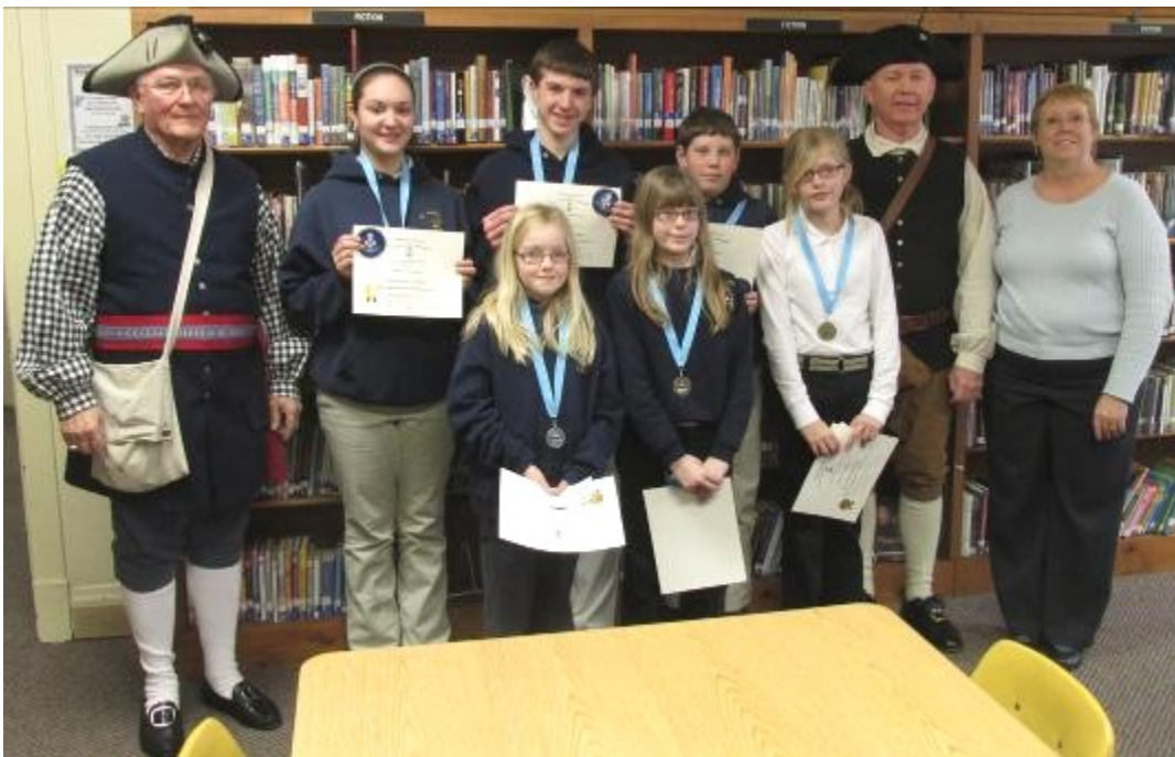
Poster Contest: Gov. Isaac Shelby Chapter sponsored the Elementary School and the Simon Kenton Chapter sponsored the Middle School. Pictured here are the award winners.