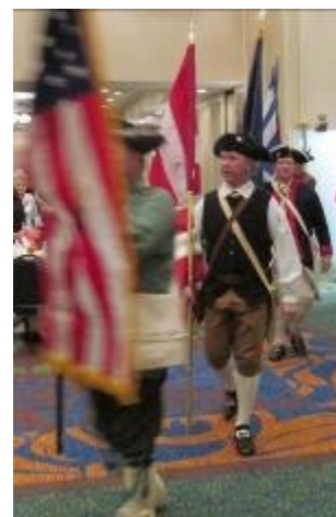
Flags entering the hall.