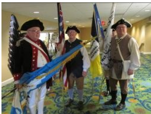
Kentucky Color Guard members waiting before posting Colors and Standards at the KSDAR state meeting.