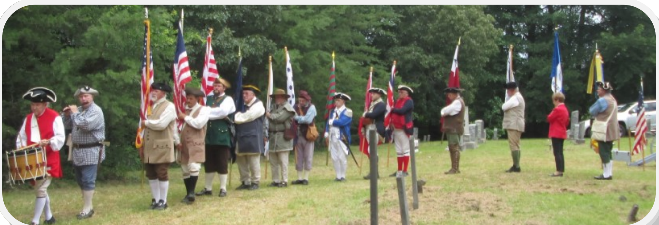
Combined Color Guard